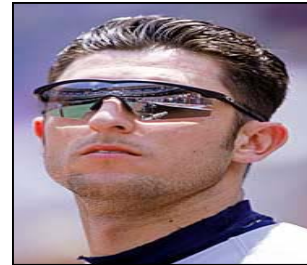
Hamm's husband, Nomar Garciaparra.

Well, not quite over. Mia will be touring the U.S. for a final "Good-Bye". This