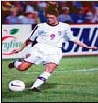
Mia Hamm: kickin' it up.

Not only did Hamm not quit this time, no, this time she became the best of the best. Hamm made the United States Women's soccer team in 1987 at age fifteen, the youngest female to ever make it. And yes, the list of amazing achievements continues, including 4 NCAA titles at the University of North