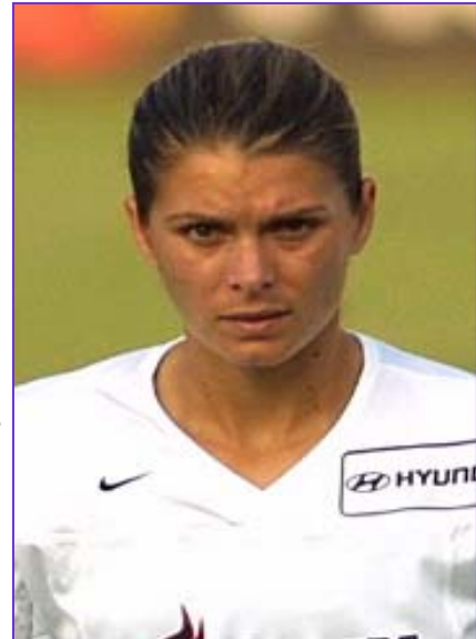
Mia Hamm at game time.

New soccer stars will rise and fade through time,