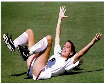
Hamm: celebrating one of her many

As a child, Hamm recalls, "I'd quit a lot of games because I hated losing so much." It got to the point where Hamm's five siblings would not allow her to play with them anymore. That is, until she discovered soccer at about age seven, and we all know